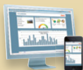
StecaGrid Portal Web portal