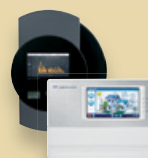
Solar-Log™ and Meteocontrol WEB'log Accessories